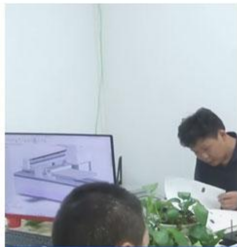
Research and development