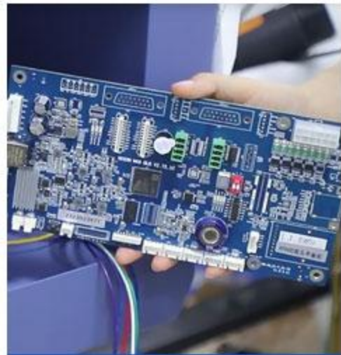
Carefully selecting materials

Strict inspection and manufacturing process control