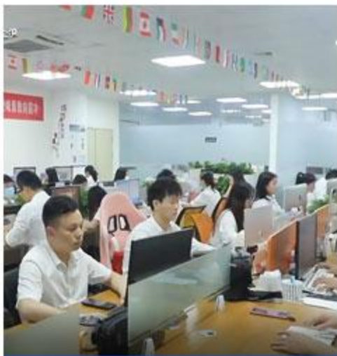
High quality service